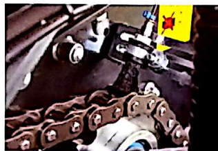
Automatic lubrication system for drive chains