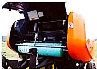
Net role holder front