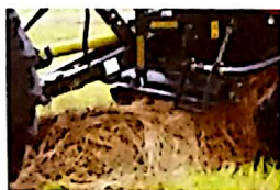
Easy high volume pick-up with short straw roller