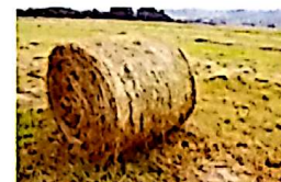
Perfect bale forming with net or twine binding

Key: STD = Standard, • = Available, – = Not available