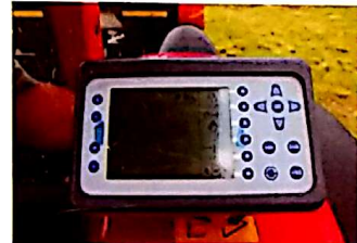
Electronic control monitor. Focus