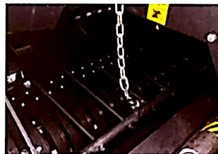
Two metre pick-up with Power Roto feeder